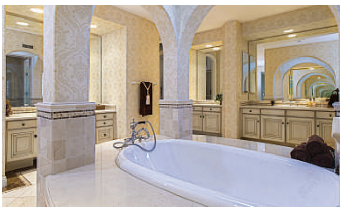
The Roman-style master bathroom is one of the homeowner's favorite features in the 6,200-square-foot home. It includes a toilet and bidet, a Jacuzzi, an oversized shower and his and her dressing stations. EDUARDO CONTRERAS • \cup - \top