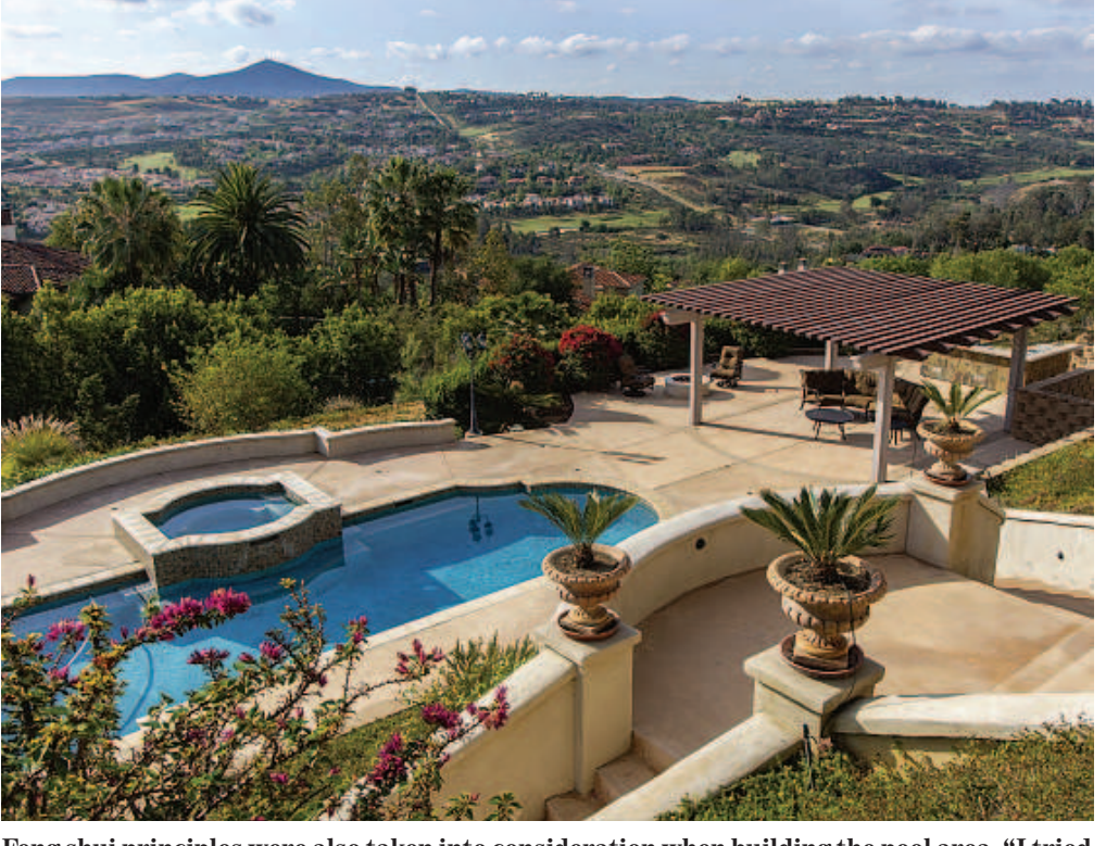
Feng shui principles were also taken into consideration when building the pool area. "I tried to keep it symmetrical with a dual curved staircase that matched the one in the house," the homeowner said. "The pool is below the house, which (in feng shui) means that it will 'catch' or 'reserve' wealth for the family." K.C. ALFRED \bullet \cup \neg

Lillian Cox is an Encinitas-based writer who has been covering North County for the Union-Tribune since 2002